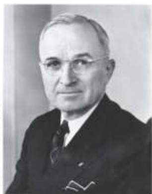
Harry S. Truman, 33rd U.S. President

We know that we enjoy these great blessings not because of any special merit on our part, but because of the bounty of God. It is to His Providence that we owe the richness of our country and our heritage of freedom. Since these good things come to us from Him, we know that we must use them for the good of others in accordance with His will."